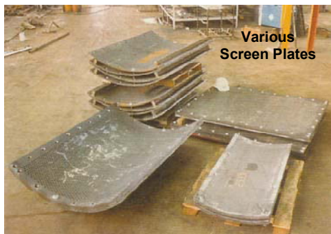
Various Screen Plates

-- Yuba, Lowe, Standard, Mipec and Bodinson Trommels -- Bethlehem and Yuba Dredges -- (as well as many others)