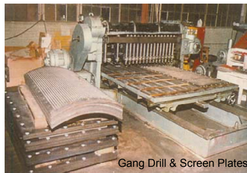
Gang Drill & Screen Plates